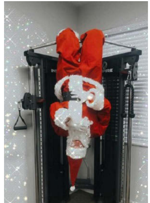
Santa in our fitness center. I guess he needed to destress before the big day!