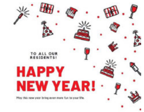
Happy New Year!