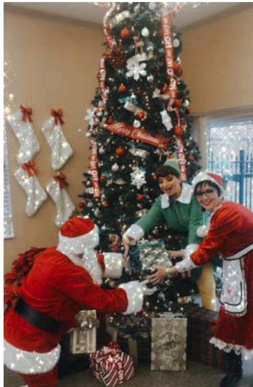
Santa, Mrs. Claus and the Elf putting packages under our Christmas Tree!