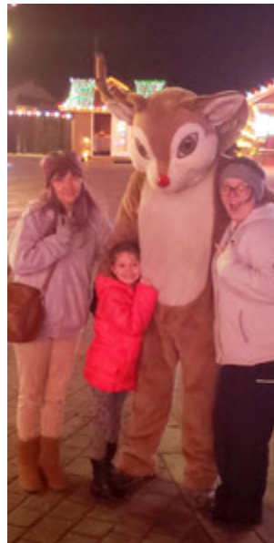
Look! It's Rudolph the Red-Nosed Reindeer! Yes, we have all been good this year!