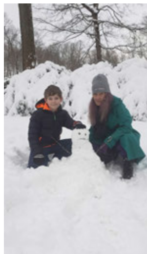
S-N-O-W! We love snow, well sometimes, as in Texas we really never had this much snow!