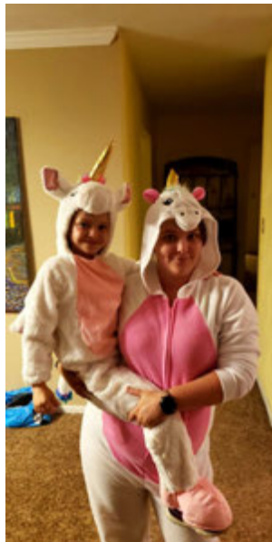
Looks like we have two unicorns here at Fieldstone Apartments!

The Pitts started their journey to Ohio late in 2018, having moved from Texas. When Hurricane Harvey hit Texas, they were lucky, as a tornado passed over their house. Luckily, it just damaged the trees and no homes. They did watch the flood waters creep closer and closer to their home and everything they owned. Luck was with them, as it stopped just 20 feet from them!