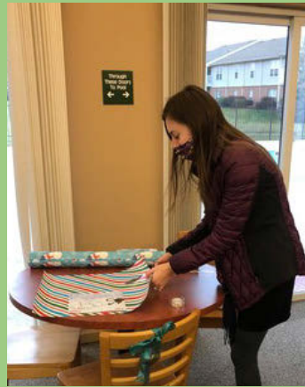
Another amazing resident who also snuck in and wrapped her gift for a loved one, in hopes they didn't see what she bought!