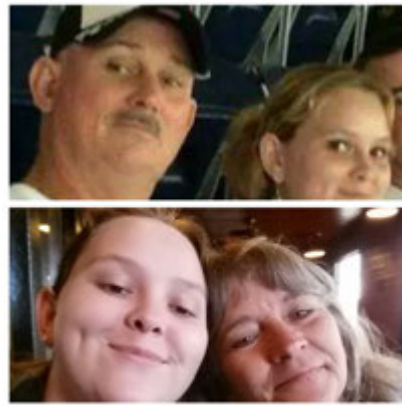
Family is everything!

They then began planning their cross-country move, and after a year, they took the plunge. It has been a huge adjustment from 80° Christmases to having a real white Christmas! After finding what they thought was the perfect little place to call home, the Memorial Day tornado stuck. Seeing their neighbors come together for those affected by the multiple tornadoes that hit that evening, they realized that living in Beaver Creek, Ohio, made them feel more like home than they could have ever imagined!