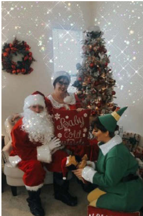
Santa stopped by one our residents' homes to say hello!