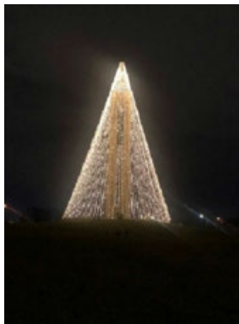
Carillon Park Bell Tower in Dayton, Ohio

In closing, I do wish you all the best in 2021!