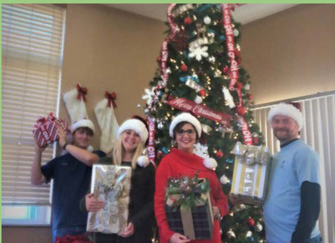
Just us having fun and hoping Santa will bring us all of our gifts! After all, we were on the good list!