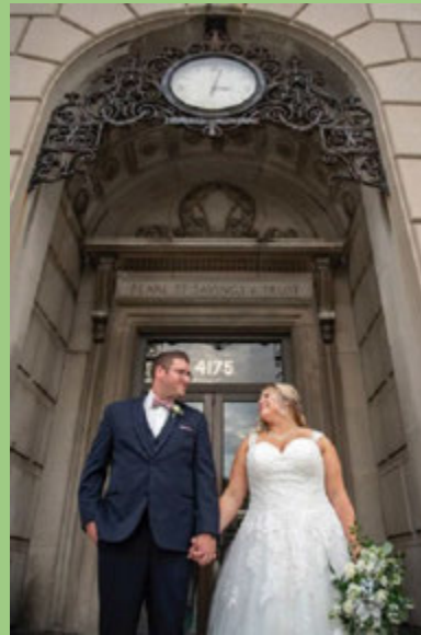
We're loving this venue!