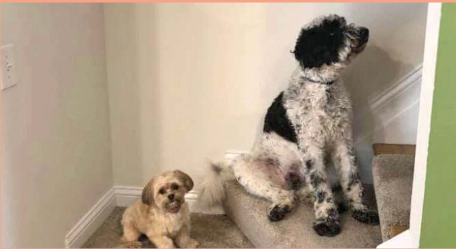
Milo and Honey enjoying their new home