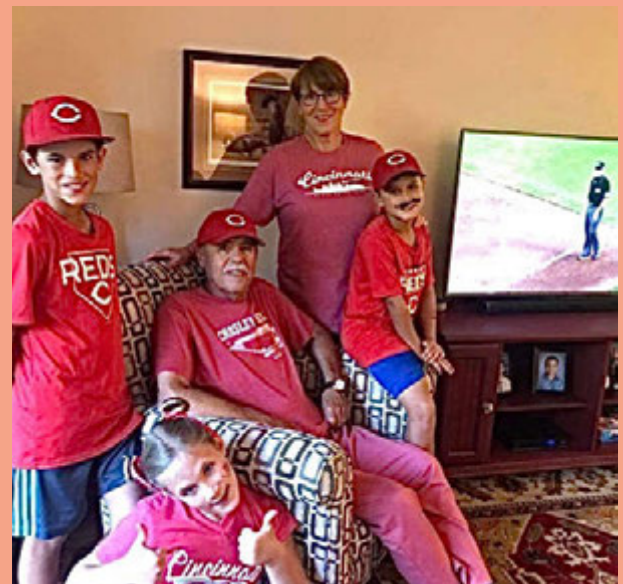
The Jacksons celebrating Reds' opening day from home with their grandkids