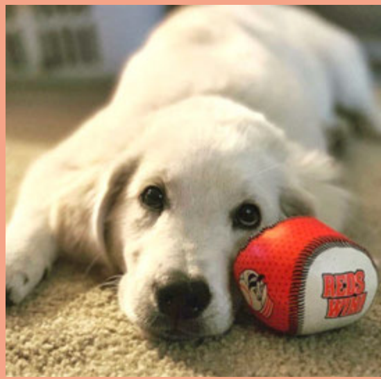
Audi's first opening day!