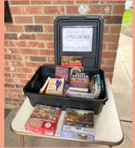
Community Library offered by our wonderful residents near the 5653 building. How thoughtful!